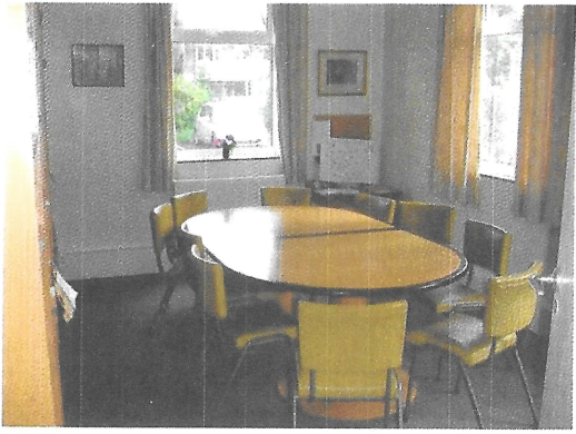
Top: George Fox Hall This is our largest space and with its polished parquet flooring is used by all group sizes (140 max.) including those holding dancing sessions and various other events. It also looks out on the lovely gardens. Below: The Elizabeth Fry room The smallest of our rooms, holding a maximum 10 persons and with its large table and chairs is an ideal meeting room, used for amongst other things small clubs and societies for discussions etc.

We see our premises as a valuable asset to be used for the benefit of the local community. We hope that you will find Bournemouth Friends Meeting House a pleasant and friendly place in which to meet.