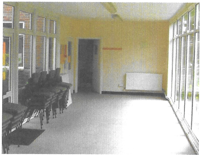
Above: The Margaret Fell room This room has pleasant views over a courtyard as well as the main gardens. Tables and chairs are available. This room holds 25 persons maximum.