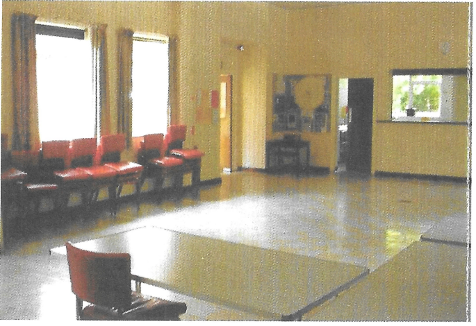
Above: The John Woolman room This is a large open space taking small or large groups up to 60 persons maximum. It is equipped with tables and chairs if required and has a kitchen facility attached with a serving hatch.